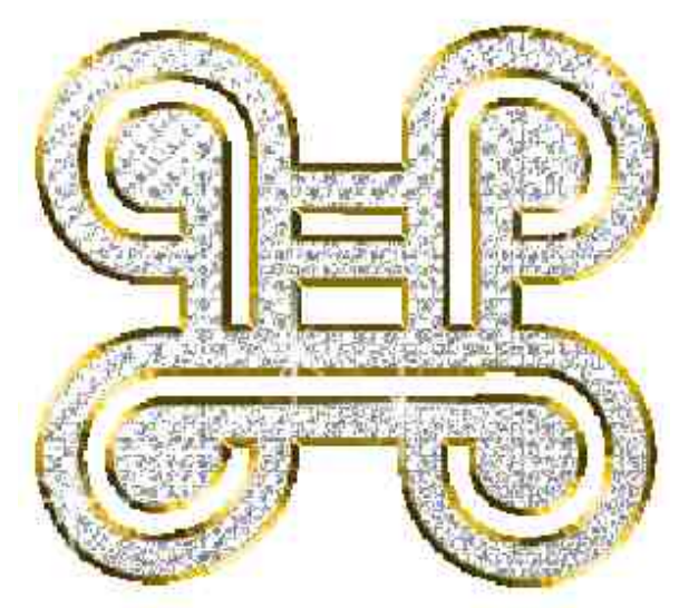
Mpatapo - Knot of Reconciliation *** Peacebuilding ***

A binding knot a mpatapo - that brings parties together in a dispute and we do indeed have a dispute and that location on the web does indeed create a binding that cannot be ignored, for peaceful reconciliation and forgiveness and deliverance of our common decency rights, including the client side rights as persons with disabilities.